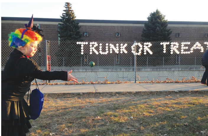
A child plays a game during the 2nd annual Trunk- or- Treat event featuring student veteran support on Oct. 31, 2014.