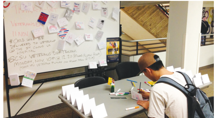
Students fill out thank you cards to be sent to the VA for Veteran's Day.