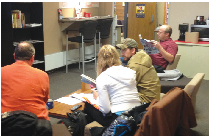
A First-year student visits with student veterans to gain insight on their experience in the VRC Oct. 30, 2014.

The St. Cloud State Veterans Resource Center is looking forward to serving the student veteran population in 2015-16 and will be playing a vital role in helping make the transition back to civilian life a little easier for it’s nations heroes. To learn more about the construction of the St. Cloud State veteran memorial and how to donate, or for further information on resources for veterans at SCSU, please call 320-308-2958.