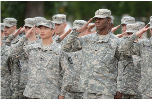
St. Cloud State ROTC members salute during the Patriot Day observance event held Sept. 11, 2014.