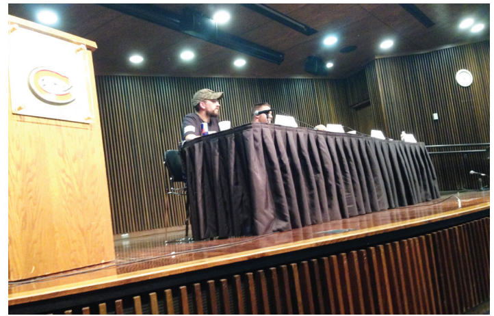
Student veterans at St. Cloud State discuss their experience in the military and life as a student during a panel discussion.

uniform, raised the flags up to the top of the flag poles in front of the administration building, and then lowered them to half staff while the military song “Taps” played in the background by a St. Cloud State trumpet player. Members of the Reserve Officers Training Corps (ROTC) program stood in formation and saluted in honor. A timeline of the attack was read by the interim Student Veterans Organization president and a moment of silence was observed. Following the program, the students, staff, faculty and community members were welcomed into the VRC for refreshments and reflection surrounding that disheartening day.