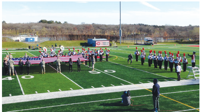
Members of the St. Cloud State ROTC program participate in a military appreciation day during a football game in early fall.