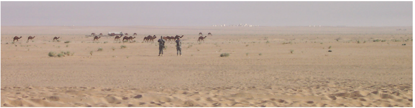
Operation Iraqi Freedom 2005 north of Al Qiam, Iraq near the Iraq/Syrian border (Syrian Desert).

of offering an environment where they can transition smoothly to campus life. They also understand the need to partner with outside groups and offer programs that will continue to assist in efforts of bringing service members home, completely. One nearby program is making strides in doing just that.