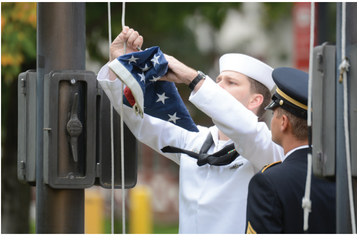
Student veterans raise the flag to half mast during a Patriot Day observance at St. Cloud State on Sept. 11, 2014.