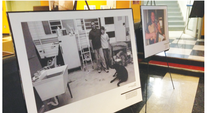
Photos tell the stories of homeless veterans and their struggles during the Veteran Storyteller event at St. Cloud State Oct. 29, 2014.