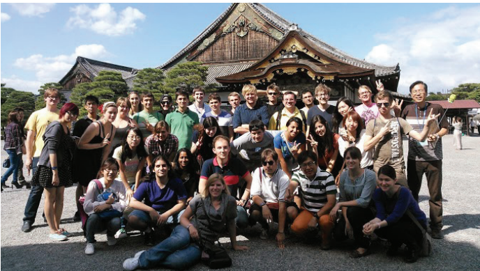
Tokugawa Castle in Kyoto.