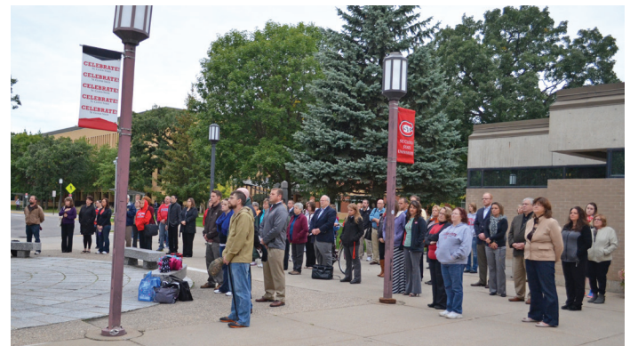
St. Cloud State students, staff, faculty, and members of the community take time observe Patriot Day Sept. 11, 2014.