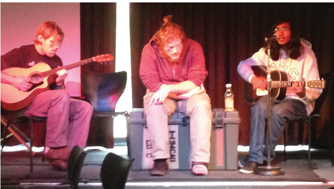
Students play music for the audience of the Veteran Storyteller event held at St. Cloud State Oct. 29, 2014.