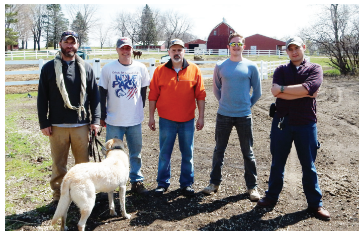
Student veterans work on clearing trails at True Strides in preparation of SAW program.