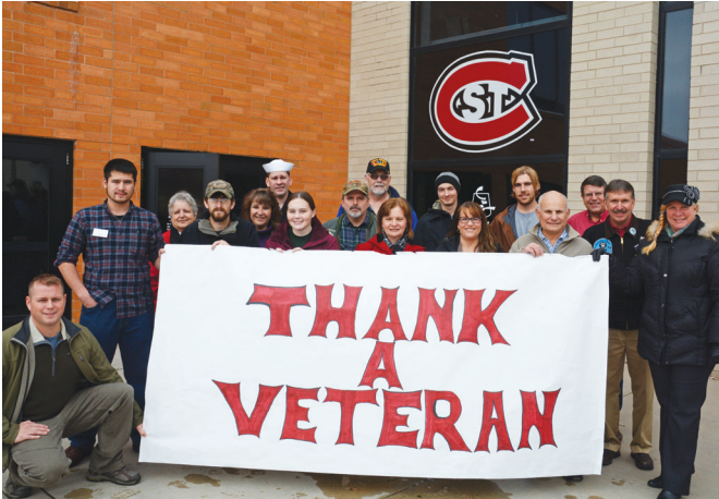
Students, staff, faculty and community members from St. Cloud State prepare to “thank a Veteran” during a Veteran’s Day event held on Nov. 13, 2014.