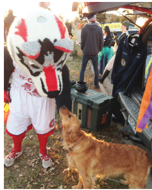
Trunk-or-Treat event at St. Cloud State.