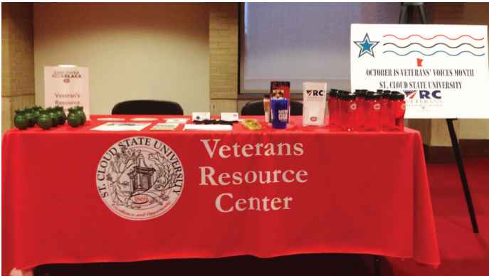
The Veterans Resource Center tables to discuss resources available during advising and registration.