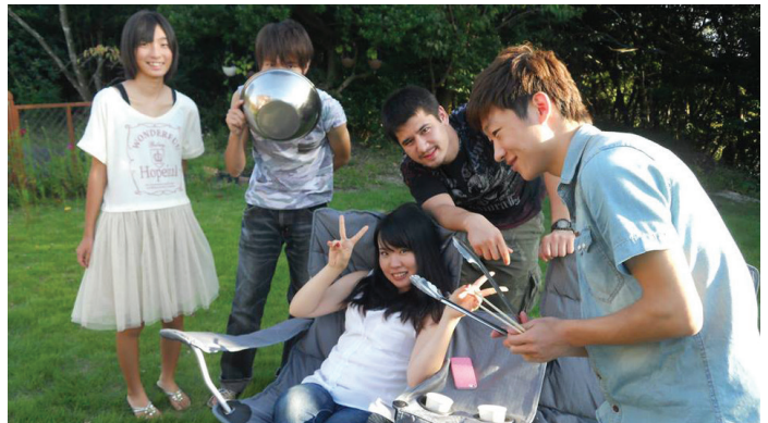
Yakiniku at Kyooske.