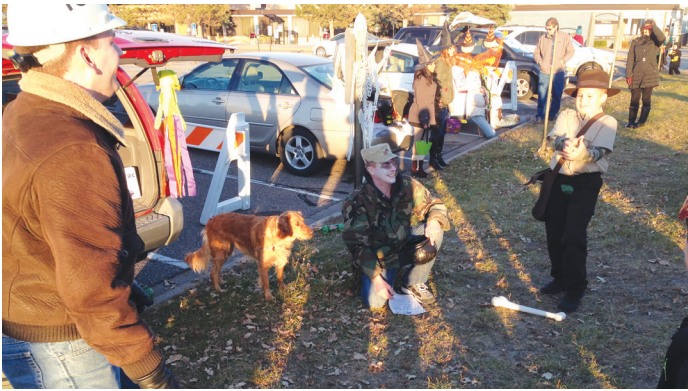
Members of the Student Veterans Organization participate in the Trunk-or-Treat at St. Cloud State Oct. 31, 2014.