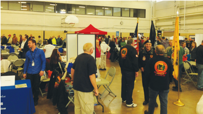
The Veterans Resource Center attended the St. Cloud Stand Down to discuss benefits with veterans.