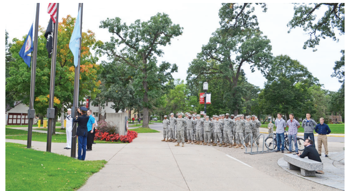
The St. Cloud State ROTC program and student veterans observe Patriot Day at St. Cloud State.