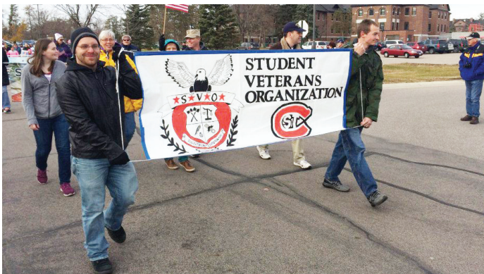
Members of the St. Cloud State Student Veterans Organization walk in the Veteran's Day parade.