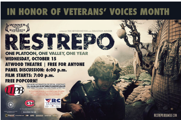
As part of Veterans' Voices Month, the VRC showed the award-winning documentary Restrepo to the campus community.