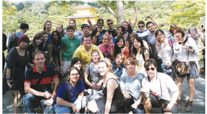
Kinkakuji in Kyoto.