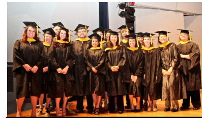
Marriage & Family Therapy