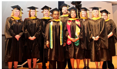
College Counseling & Student Development