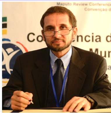
HRH Prince Mired Raad Zeid Al-Hussein