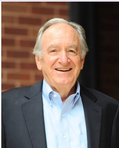
Senator Tom Harkin (Retired)