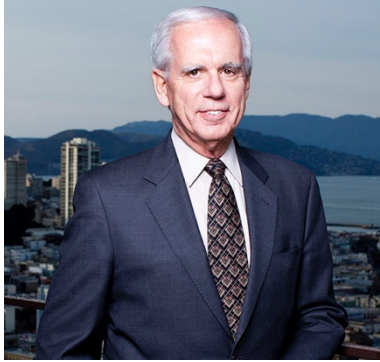
The Honorable Tony Coelho

The Honorable Tony Coelho is a retired U.S. Congressman from California, a former House of Representatives Majority Whip, Democratic Congressional Campaign Committee Chairman, and the principal author of the Americans with Disabilities Act. Diagnosed with epilepsy when he was 22 years old, Mr. Coelho has spent his entire adult life helping advance the lives of people with disabilities. While he calls this his “ministry”, those in the disability community call him their “voice” and “champion.” Mr. Coelho founded The Coelho Center for Disability Law, Policy, and Innovation at Loyola Marymount University.