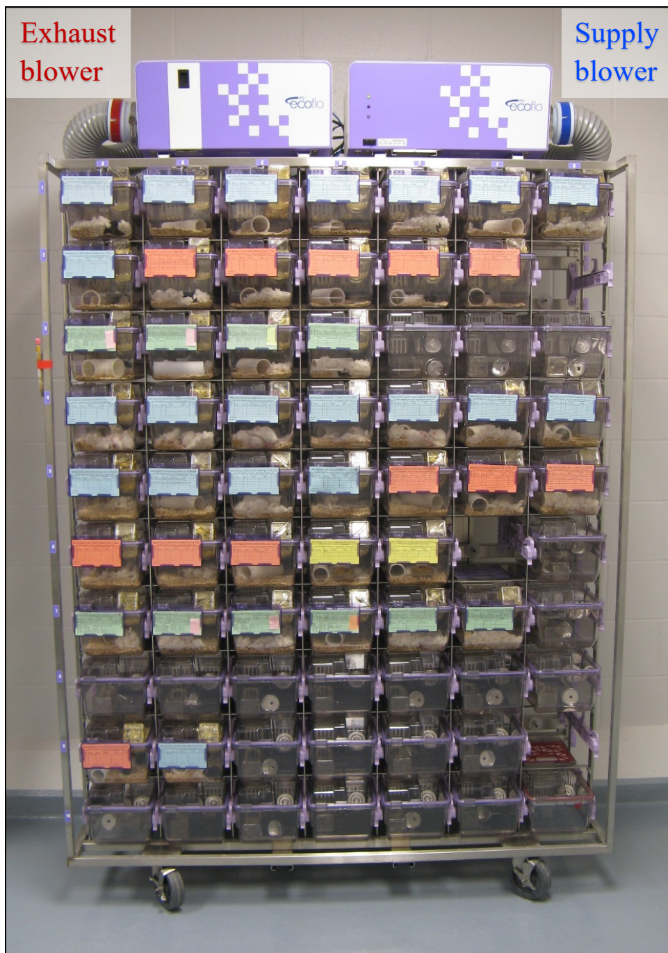
Figure 1. The NexGen™ mouse caging system

The NexGen™ caging system supports 70 cages and currently houses two strains of mice - C57/BL6J and NOD/ShiLtJ. Husbandry practices are identical for all strains.